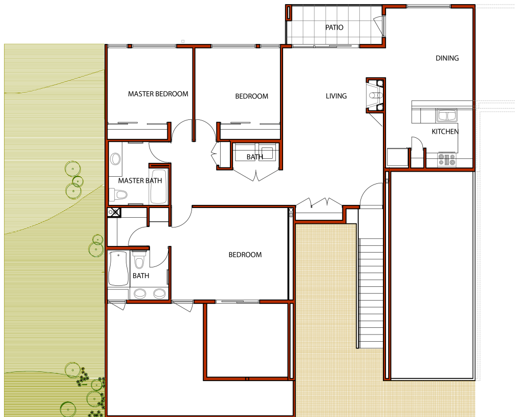
Third Floor - Unit C - 1,524 SF

FLOOR PLANS ARE SUBJECT TO CHANGE. VERIFY WITH YOUR ZOCALO REPRESENTATIVE.