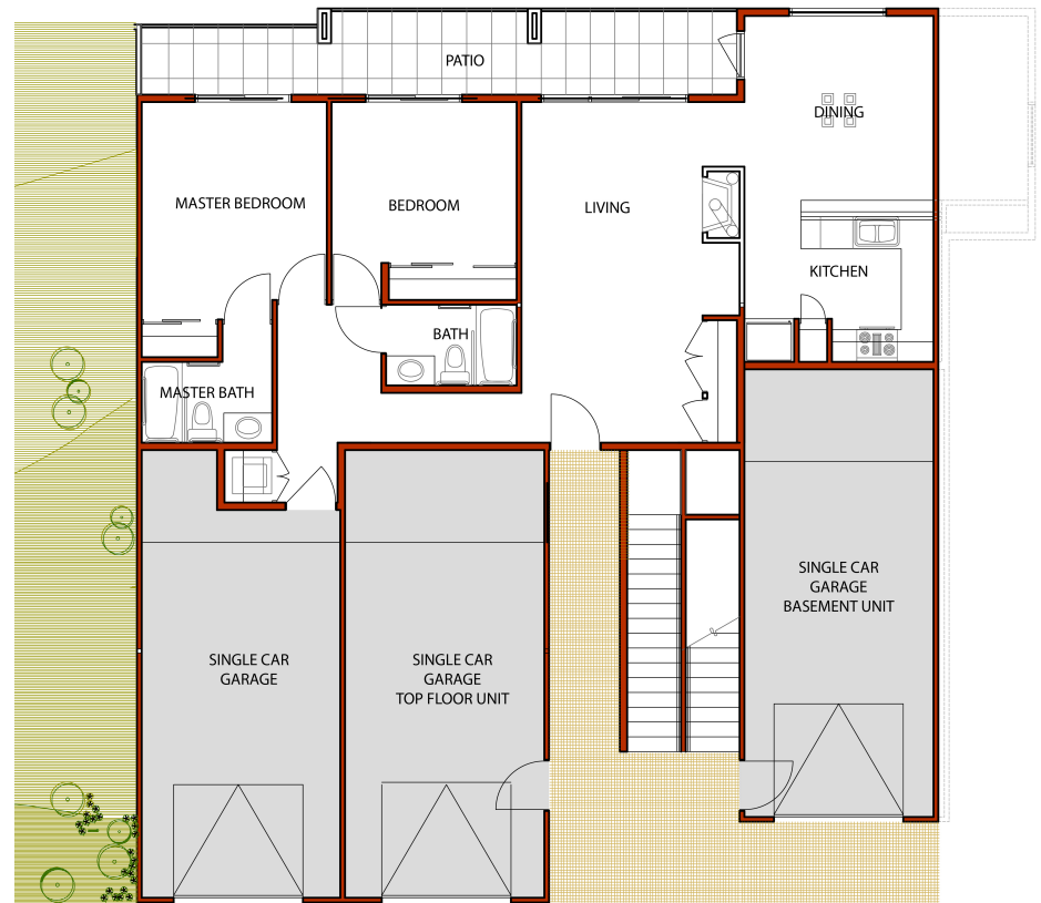
Ground Floor - Unit B - 1,206 SF